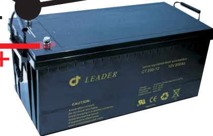
CT-Leader AGM Deep cycle battery 12 VDC, 200 Ah > 500 deep cycles, 50% DOD 10-12 year EuroBat classification