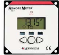
Optional meter RM-1